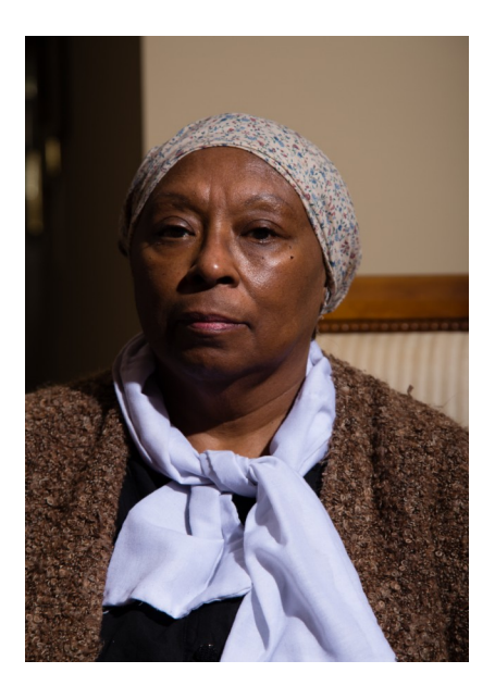
Saturday, February 17, 2018 at 2pm